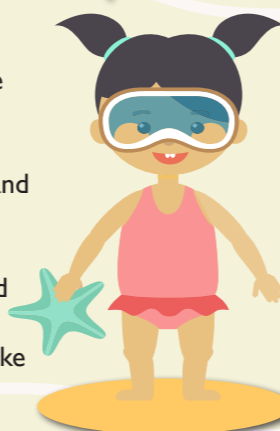
Figure out what I want to say, and put it into words for me.